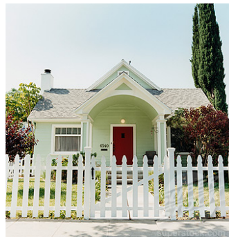
An American Dream

the negative things that life may hold is a sure way to be miserable. Thus, most people don't look to the future and plan on losing a job or having