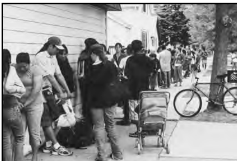
A portion of the morning line allowed to assemble at 8:30.

"Give and gifts will be given to you; a good measure, packed together, shaken down, and over-flowing, will be poured into your lap. For the measure with which you measure will in return be measured out to you." ~ Luke 7:38